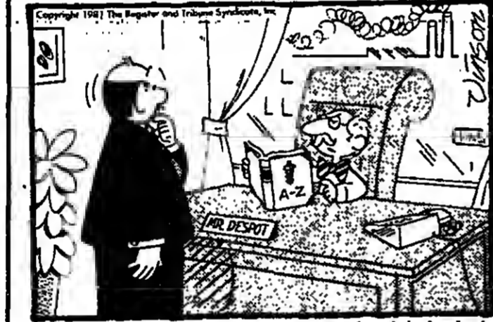
"The fact that your illnesses occur in alphabetical order proves nothing, but yesterday you phoned in with a WOMEN'S disease."